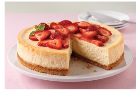
... and cheesecake!